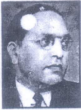
'The Father of Indian Constitution' - Dr. B. R. Ambedkar