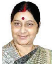
Smt. Sushma Swaraj Hon'ble Minister of External Affairs & Chairperson, IDF-OI

IDF-OI is administered by a Board of Trustees, chaired by Smt. Sushma Swaraj, Hon'ble Minister of External Affairs.