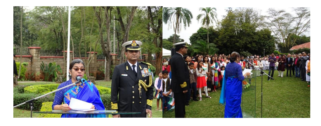
Around 450 people including members of the Indian community and friends of India attended the function.