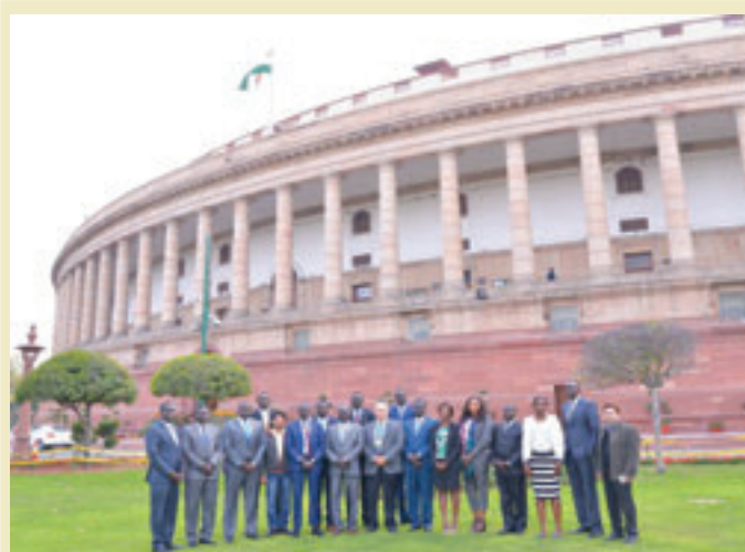
Parliament of India