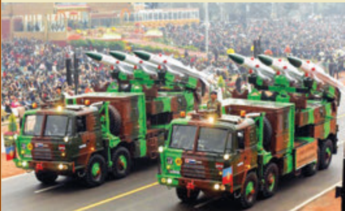
Mechanised columns display ordnance at the Parade