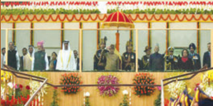
President of India HE Mr. Pranab Mukherjee takes the salute