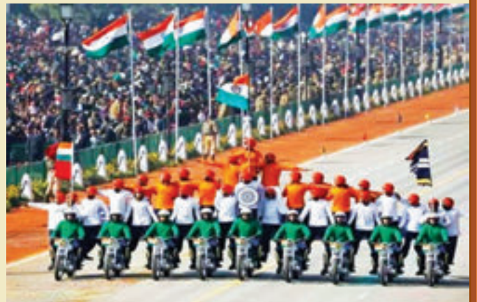
Daredevil motorcycle riders of the Armed Forces performing stunts on Rajpath