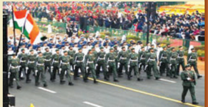
Marchpast by a military contingent of UAE – the first time that Arab soldiers participated in the R-Day parade