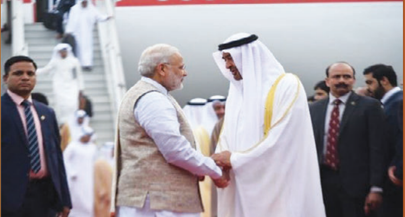
The Crown Prince of Abu Dhabi Sheikh Mohammed bin Zayed Al Nahyan was the Chief Guest for India's 2017 Republic Day parade.