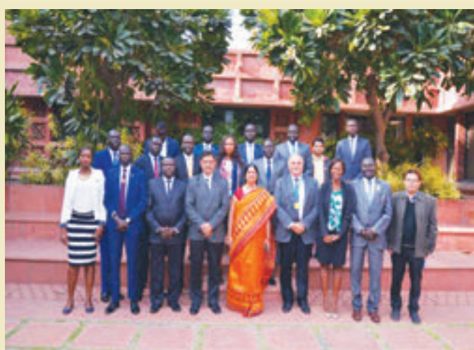
Election Commission of India