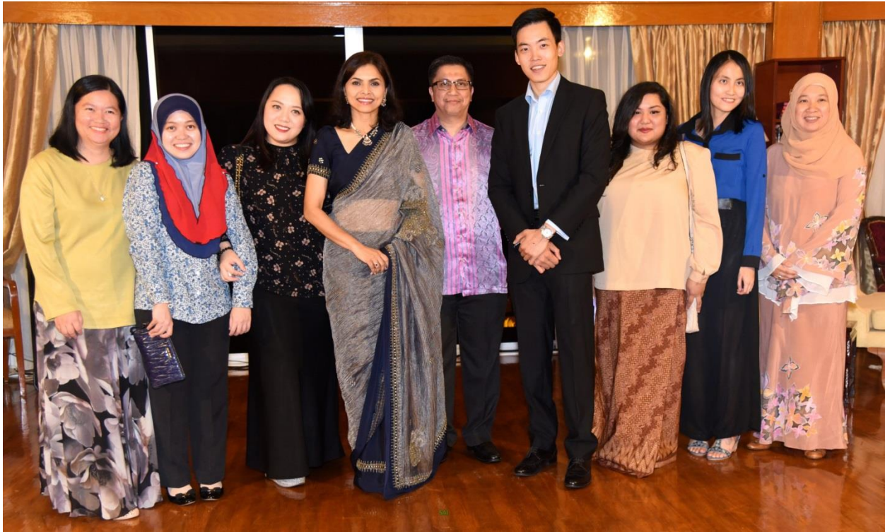
High Commissioner, Smt Nagma M Mallick with ITEC Alumni and other guests

The Indian Technical and Economic Cooperation Day 2016 (ITEC) was organized at India House on Oct 27, 2016. About 50 guests including the ITEC alumni from the Audit Department, Narcotics department, officials from Ministry of Foreign Affairs and Trade (MOFAT) and office bearers of the Indian associations attended the celebrations.