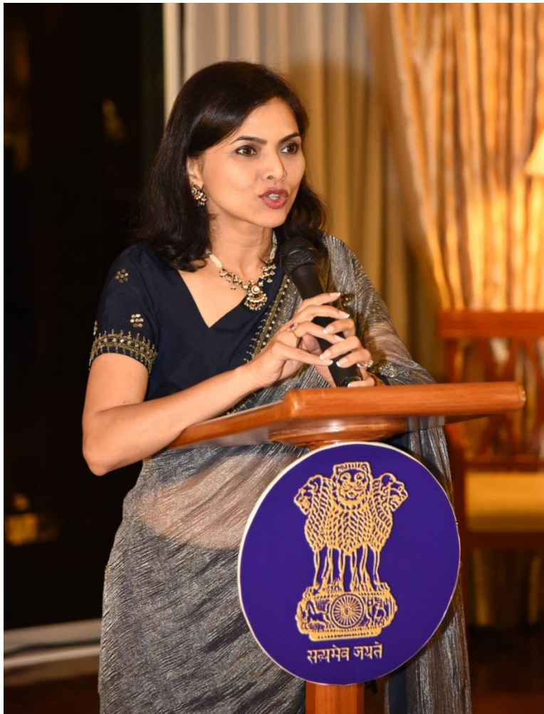
High Commissioner delivering speech