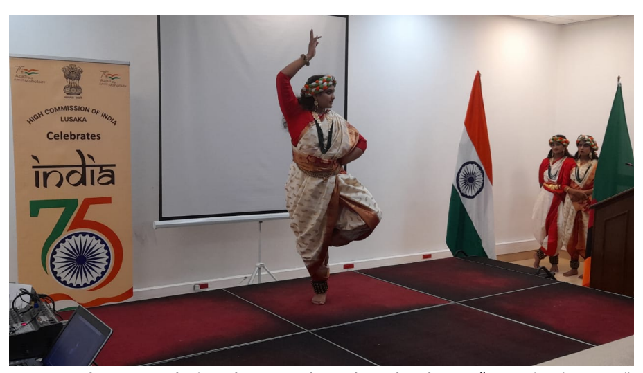
Dance performance during the event based on the theme "Constitution Day"

10. To project India's rich cultural heritage and soft power, two Indian dance performances also formed part of the programme. The guests enjoyed the programme and appreciated the efforts of the Mission in organising such high quality programme. The event also got coverage in local print and electronic media.