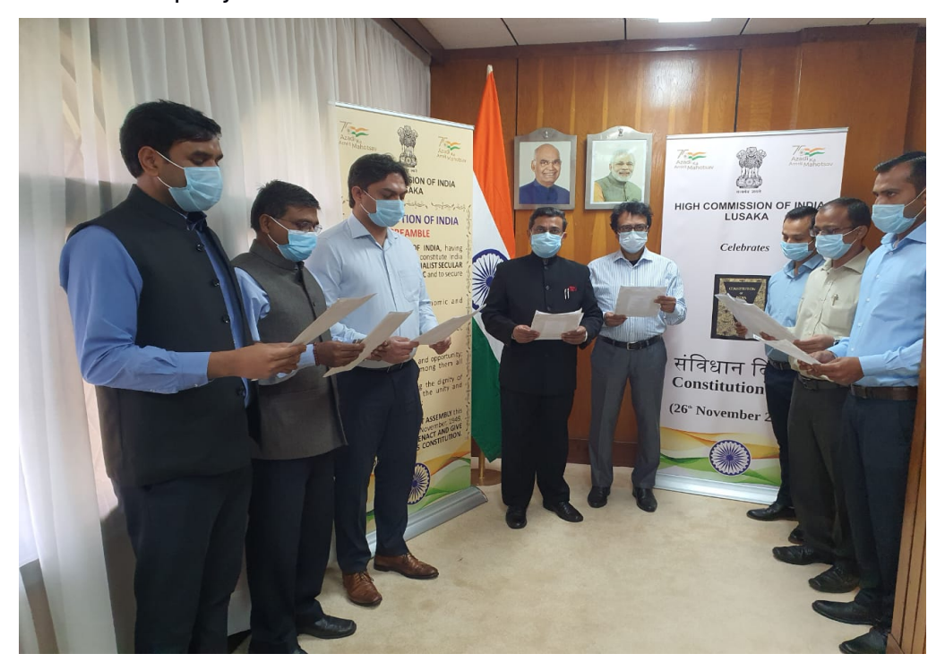
India-based personnel reading Preamble of the Constitution

2. India based personnel read out the Preamble simultaneously with the Hon'ble Rashtrapatiji.