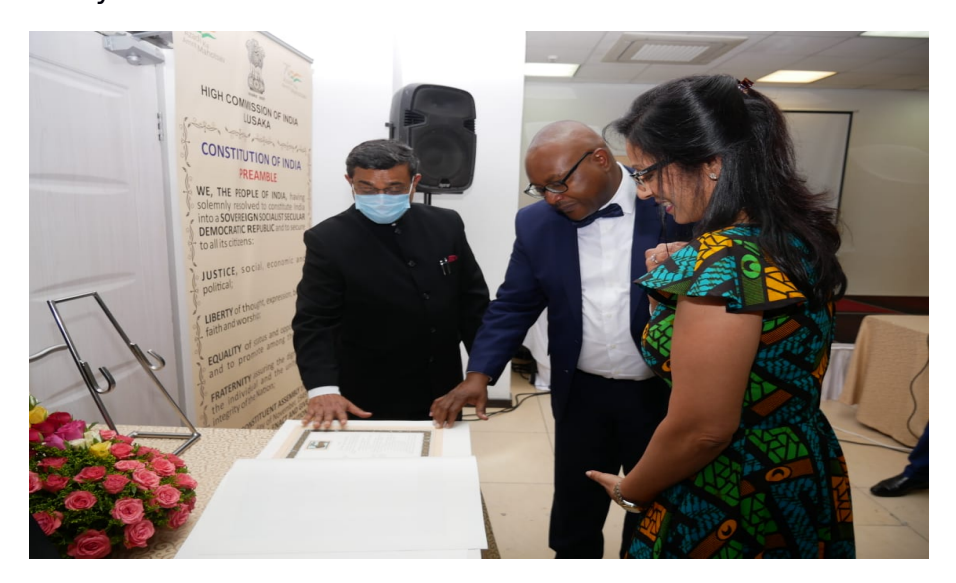
High Commissioner H.E. Mr. Ashok kumar showing Preamble of Constitution to the honoured guests

9. The Constitution of India and the Constitution of Zambia were displayed prominently at the venue.