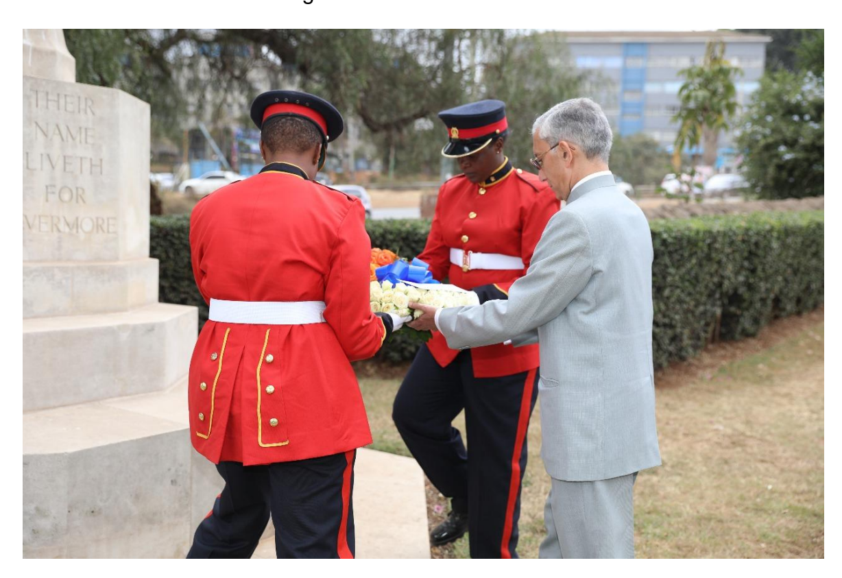
[Nairobi, 15 August, 2019]

4. High Commissioner also laid a wreath of flowers at the Commonwealth War Memorial in Nairobi. The memorial is dedicated to Indian and British Officers and men who laid down their lives in 1917 during the First World war.