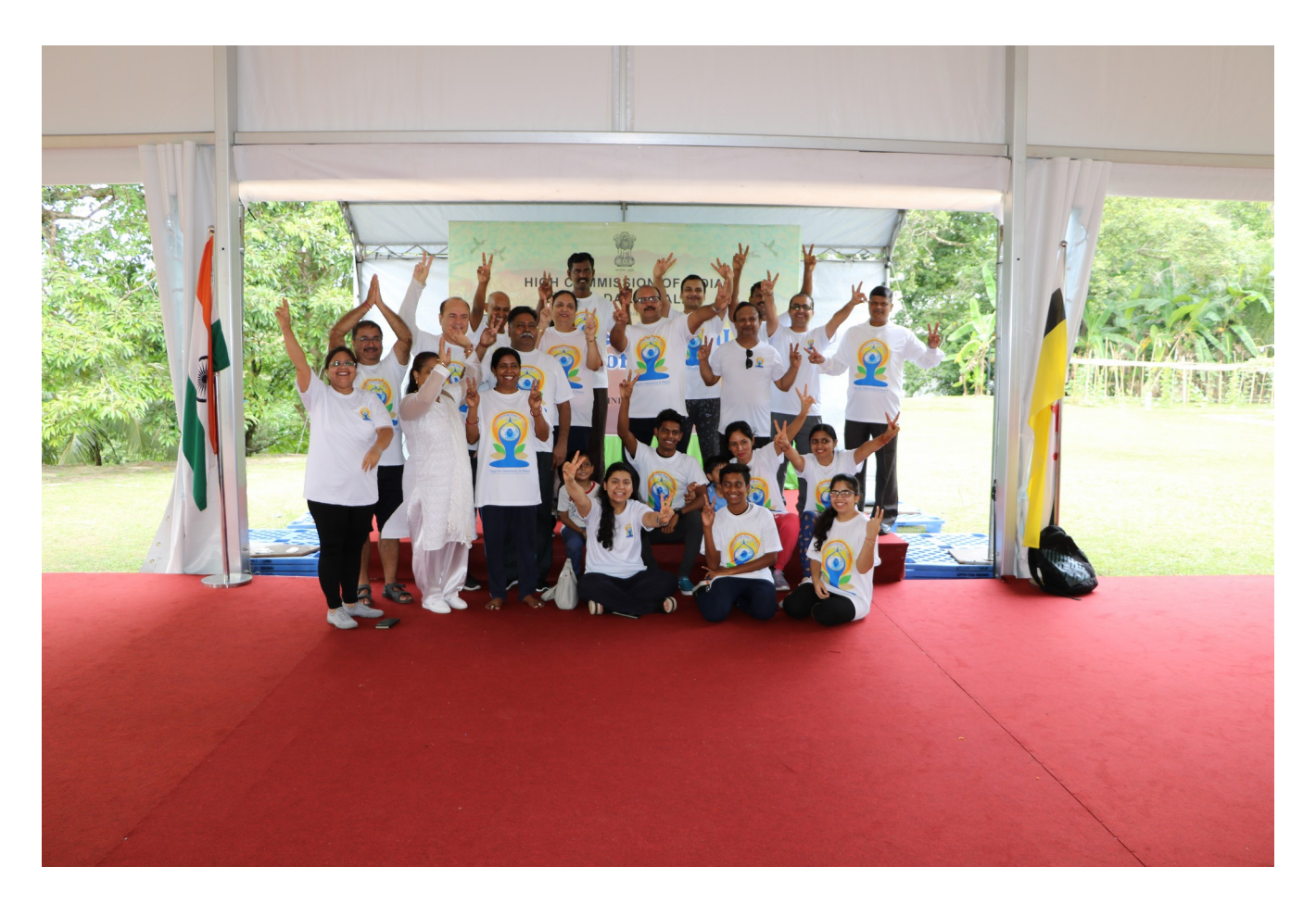
Brunei Darussalam 16 June 2019