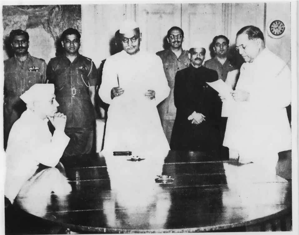
Dr. AMBEDKAR being sworn-in as the First Law Minister of Free India by the President Dr. RAJENDRA PRASAD