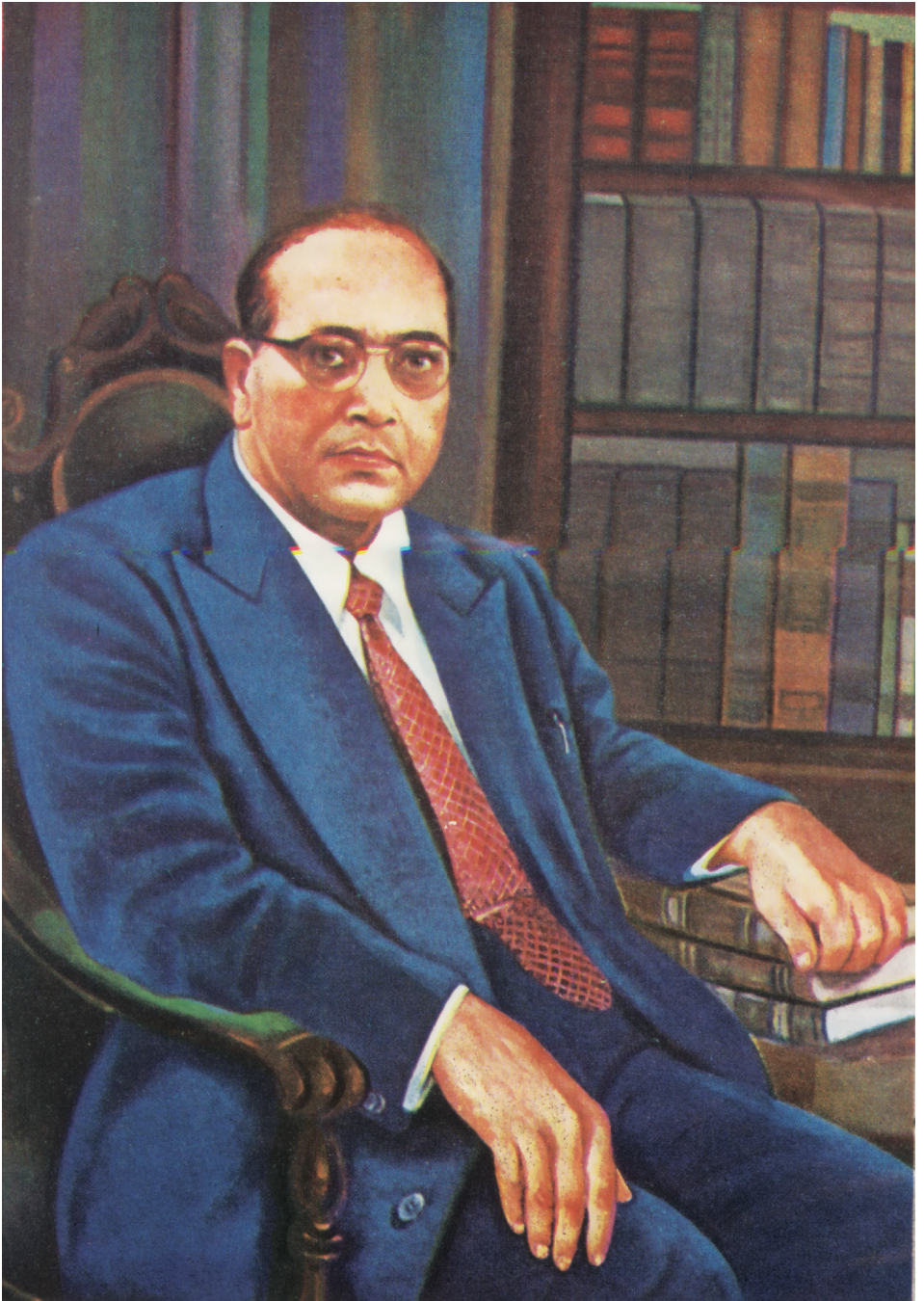
Babasaheb Dr. B.R. Ambedkar (14th April 1891 - 6th December 1956)